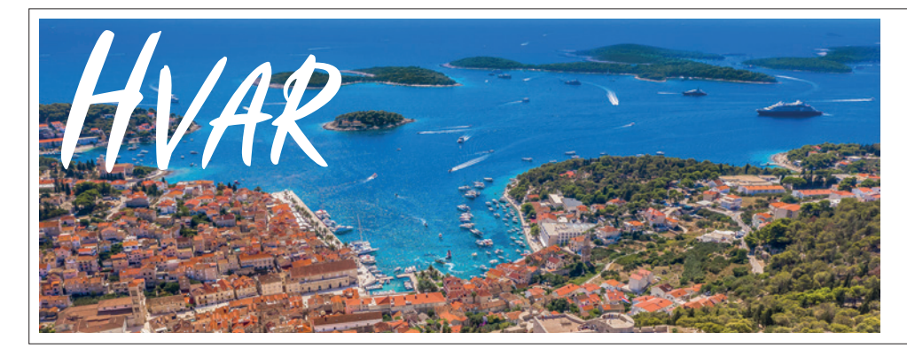
A unique fusion of luxurious Mediterranean nature, rich cultural and historical heritage. Hvar Island leaves guests with unforgettable experiences.

Tourists have also chosen to discover the narrow streets and Renaissance buildings of the old town, a relaxed and atmospheric port town which is lined with art galleries, ice-cream parlors and welcoming restaurants. One of the oldest continuously inhabited settlements in all of Europe, around Stari Grad there are olive fields and vineyards that have been cultivated without interruption since the arrival of the first Greek settlers in the fourth century BC.